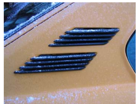
Touring in snow.