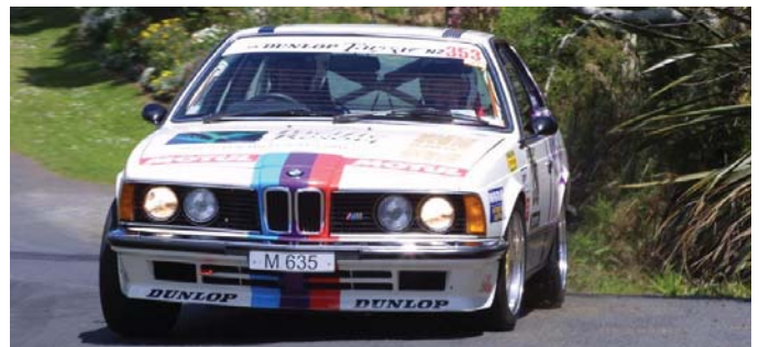
On victory road.