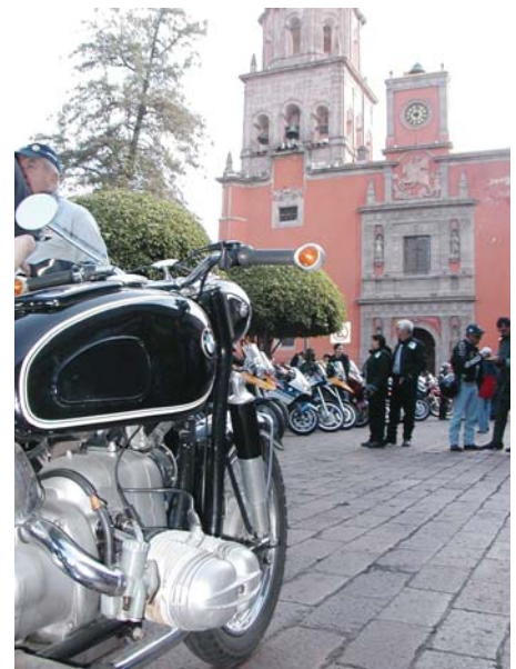
The town of Queretaro.