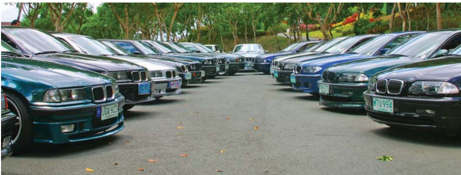
Club vehicles line up.

Several companies have seen opportunities from the group’s activities and in fact, have stepped forward in support of the club and its purpose. The club can be reached thru its English-language website: www.bmwclub.org.ph containing all the “happenings” within the club. Members and visitors can interact thru the forum. As such, we are inviting visitors to come and see the website. If by any chance you are coming to the Philippines, just inform the club thru the forum so that you will not only see but experience the passion and hospitality of the Filipinos.