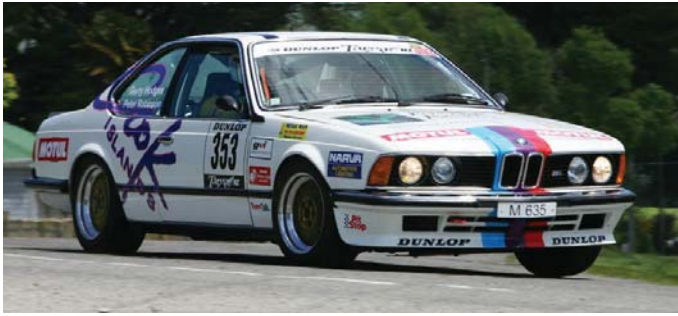
Targa 2005 New Zealand.

the Wairarapa & the Southern Hawkes Bay through some of the most amazing scenery this country has to offer.