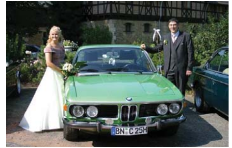
A special vehicle for a special occasion.

Once again we can look forward to numerous events featuring BMW automobiles and motorcycles. You will find an overview of the first few events here. If you find your event is missing, please send us the relevant information. You will also find a current calendar of events on our website at www.bmw-clubs-international.com .