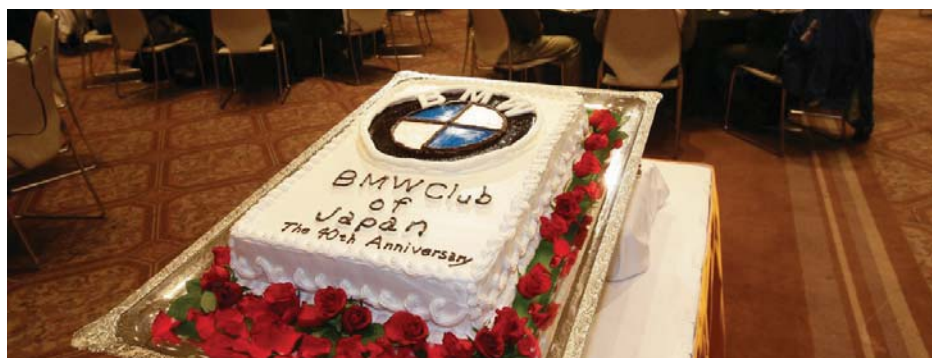
The anniversary cake.

celebrate the 30th anniversary of the debut of the BMW 3 Series. The event took place at Yatsugatake Plateau in Yamanashi