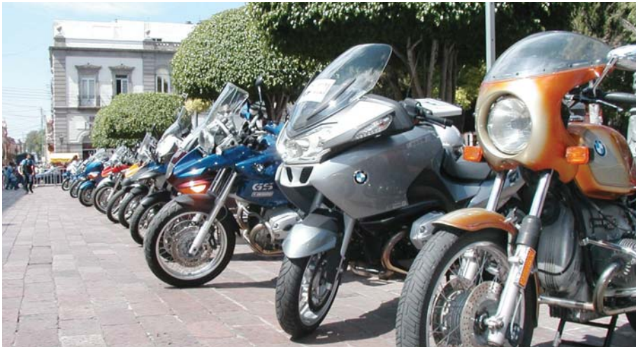
Yesterday and today.

rally. Everyone is even provided with nametags with a detailed schedule of events in a plastic holder. After breakfast provided by the hotel everyone gathered in the garage for the 9:00 group ride departure for the town of Bernal. At least 200 bikes participated in the ride that was well escorted by local police with club marshals keeping everyone headed in the right direction. Tourism and shopping are popular in this quaint little town with the nearby solid rock peak called Peña de Bernal as a beautiful backdrop. At 237 meters it is the third largest solid natural pyramid in North America and is believed by some to impart a cosmic energy that results in the locals enjoying extraordinary longevity. A light rain did not dampen the groups' efforts to visit shops and to taste-test the local culinary delights offered by various street vendors. About 13:00 the entire group was off to the Cavas Freixenet Winery for a tour and lunch. The tour was very informative and available in English. The two-hour lunch was a typically excellent Latin affair in a beautiful setting where everyone could spend time relaxing and meeting new friends. And then there was the return ride to the hotel! After meeting the mayor of Querétaro in the parking lot he volunteered to lead a group back to the hotel on his K1200LT. Ken O'Malley along with Canadian friends Wayne Doherty and Carol Taub in tow all proceeded to enjoy a "spirited" ride that tested the limits of our passing and stopping ability as we