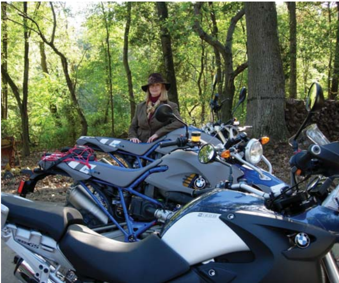
The exotic BMW R1200 GS HP2 wowed even the horse crowd in Tennessee.

Next year's rally will be more rural still, in far away Idaho, and the attendees will trade the elegant Tennessee horse venue for the lair of the Rocky Mountain Grizzly Bear. Though the rallies are located some 3000 miles apart, some of the same people will be there.