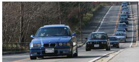
Convoy of the BMW Club of Japan.

The second day began with a drive-by procession of cars at the foot of Yatsugatake Peaks, to Moegi-no-Mura. Participants