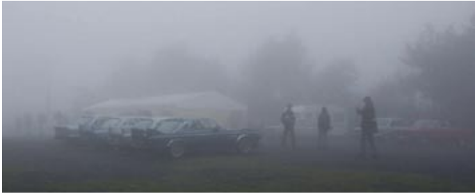
Famous Ring weather – fog all around

By the OGP Organization Team of the International BMW Classic and Type Clubs Section