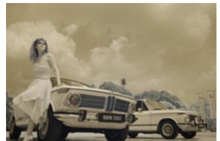
Winner picture of the "Dynamic Diva" Contest in Indonesia.