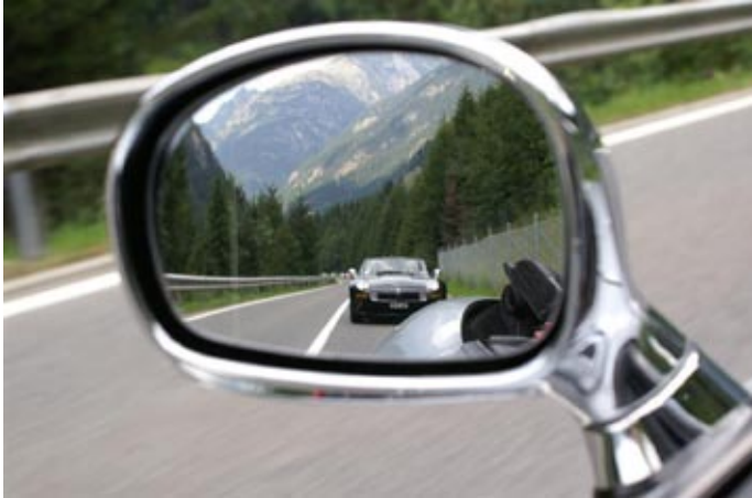
BMW Z8 in the side mirror