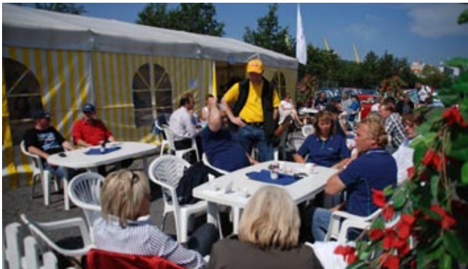
Enjoying the sunny weather in the beer garden

The clubs splashed out and rented a large area in the parking zone A7 where a spacious tent was set up with furniture and its own beer garden. Incidentally, at club events of this kind the catering is always excellent.