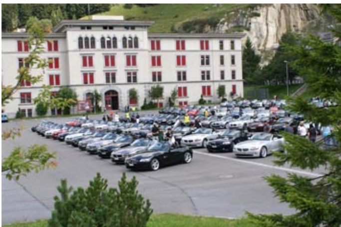
Z parade in Andermatt

This year’s BMW Z Rally took Z fans to Andermatt on Sunday, August 19 th , 2007. From eight different starting points, Club members guided participants along predetermined routes towards Gotthard. A few BMW dealers started with their customers directly from dealership premises also. It is always possible to travel individually too, of course, and about 25% of participants generally take this option. Once again all BMW Z models (BMW Z1, Z3, Z4 and Z8) were officially invited. As in 2004 and 2005, a back-up program was offered for those who had come a long way. Friends from Germany, Belgium and France made the most of this.