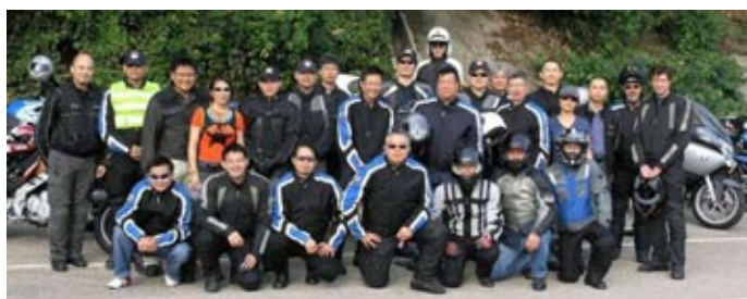
AGM ride group photo

The club was formed with the main purpose of promoting rider safety, road awareness and enhancement of riding skills, promoting the enjoyment, sharing of goodwill and fellowship derived from owning a BMW motorcycle and engaging in social, community and other events, which are in harmony with the Club purpose as mentioned above.