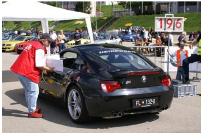
BMW Z4 M Coupé

attractive entry prizes were awarded. Unfortunately, we were not able to hold the award ceremony as planned and expressing thank to all the club helpers, fans at home and abroad and the BMW dealers actively involved. A storm gathering over the blue and white Z community forced us to speed things up. After the draw and with the storm imminent, we were forced to take our leave hurriedly and embark on the home journey. According to later reports, the various groups experienced different weather conditions. The Z3 Club was certainly able to enjoy several kilometers of open-top driving.