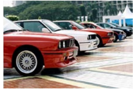
BMW M Cars on the Bimmerfest 2007 of the BMW Car Club of Indonesia

You will also find a current calendar of events on our website at www.bmw-clubs-international.com