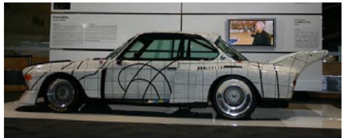
Frank Stella 1976 – BMW 3.0 CSL

Not many articles are written that would suggest a race E30 M3 with a vivid depiction of the Australian wilderness could be overwhelmed by other vehicles, however, in this company this most surely was the case. The M1, while not a particularly successful road or race car, at least not in this lofty company, is surely one of the finest automotive forms created, particularly when without racing appendages, a beautiful compromise of Italian flare and Germanic engineering producing a timeless silhouette. With Warhol's asymmetrical brush strokes and organic paint globs this car represents the most unconventional of the art cars present and produced the most challenging artistic comments from the BMW faithful gathered.