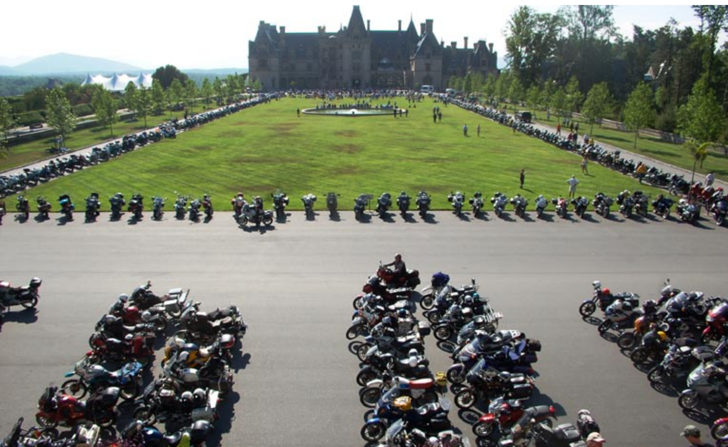
The BMW Riders Association at the Biltmore Estate

Newsletter of the International Council of BMW Clubs