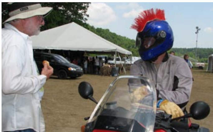
New helmet look

There were BMW bikes as far as the eye could see, with the beautiful Blue Ridge Mountains in the neat distance. For the entire four days the famed Blue Ridge Parkway was swarming with our favorite motorcycles. A lone (but much-admired) MZ4