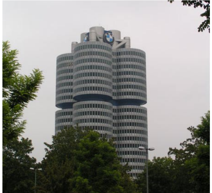
"4 cylinders" – BMW Headquarters in Munich

After the car is finished, it is put on rollers so they can test that all the systems are working properly. The car is accelerated up to 150 km/h following a predetermined test process. After 2 hours our factory tour was over and we said good-bye to our guide. In our free time after the factory tour we headed to the BMW Museum and the Olympia tower. I highly recommend the eleva-