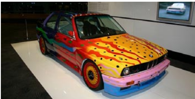
Ken Done 1989 – BMW M3

With much anticipation and fanfare the BMW Art Cars evening attracted one of the largest gatherings ever to a New Zealand BMW Club event. For weeks ahead titillating banners had decorated the streets of Auckland with pictures promoting the Bavarian automotive road show that the Auckland Museum was to display. The venue, the museum's domed events center was a fitting location for such a blend of artistic and engineering flare. The selection of vehicles chosen was equally appropriate as a sample of BMW's greatest competition machinery from an era when novel technical solutions produced gorgeous aesthetic forms to meet stiff competition from other marques. The creative additions of some of the twentieth century's finest artists further added to the dramatic shapes created by the factory.