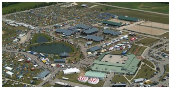
Area of the International Rally

The BMW Motorcycle Owners of America held its annual International Rally in West Bend, Wisconsin from July 12–15, 2007. The Rally had a Bavarian theme replete with German bands, lots of German food and even a living Glockenspiel. Nearly 8,000 BMW riders made the journey from all across the United States, Canada, Mexico and many other locations to include Germany, Japan, Australia, China, Spain and the United Kingdom.