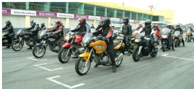
Rider training in Zhuhai International Circuit 2006

us organizing a Trans-Malaysia tour for the past two years and we are in the process of planning another for 2007.