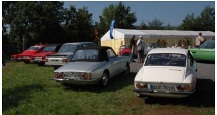
Many BMW enthusiasts came together

– at the centre of BMW Club activities for three days – could only be seen in outline. However, the mood of visitors, including BMW Club Driving Safety Training participants, was not affected in the least. There were already a large number of BMW classics to be seen (you just had to get up very close), whose owners had not been put off by the adverse weather conditions.