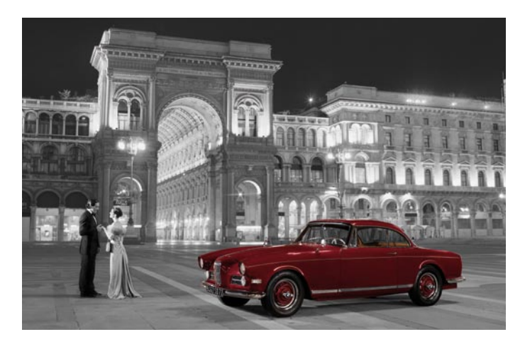
The noble classic: BMW 503 from the year 1955

The book and the film are available from the publisher HEEL Verlag in Königswinter (Tel. +49 (0) 2 22 39 23 00). The two products are available to BMW Club members as a package at the special price of 25 euros.