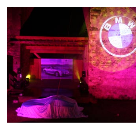
Annual meeting of BMW Clubs Österreich: BMW Austria presents new BMW Z4 M Coupé

www.siha.de bmwccv.bmwclubs.asn.au jahrestreffen.bmw-e21e30.de www.grossglocknertreffen. bmwklassiker.com