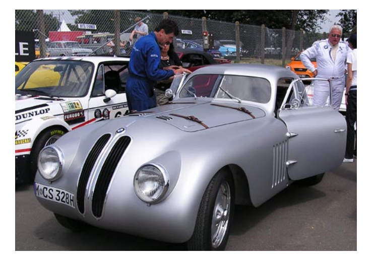
Final preparations for the manufacturer parade – Holger Lapp (Head of BMW Mobile Tradition) and the BMW 328 Mille Miglia Coupé

Before the start of the races, on Saturday, a group of 20 BMW cars were allowed to do the "parade" on the long 24h circuit.