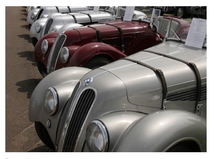
Bonnet line up.

The Club had reserved a ground floor box at Woodcote corner where light refreshments were available, together with a TV