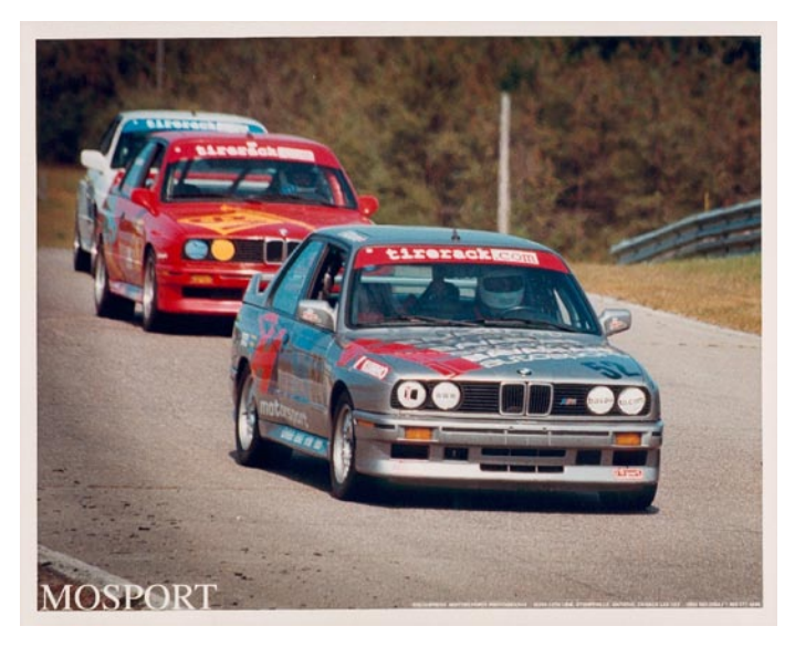
Club racing weekend at Mosport near Toronto, Canada

A few years ago, I ran in a club racing weekend at Mosport near Toronto, Canada. I don't have a lot of money to spend on racing and usually try to do it as cheaply as possible and still be competitive. Some of you would say that's impossible and actually, I can't disagree. Anyway, this weekend of racing ended with an enduro. My co-driver and I were positioned for a class win if we could find a way to get ahead of a team of experienced racers and deep pockets, also driving a BMW E30 M3.