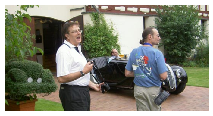
International Council Meeting 2005 in Simmelsdorf

It all began for me with a test ride in a 1978 BMW E21 320i, which we were comparing to a Porsche 911. Well, the P-car was neat and my girlfriend, now wife, managed to get a speeding ticket in it but there was something about the Bimmer which made us buy a new one. It was Sierra Beige, with tan cloth interior, sunroof and limited slip differential. I added an aftermarket sound system (Alpine & ADS) and we were blissfully happy for a couple of years. Joined the BMW Club too. Then I did a driving school with the BMW Club at Lime Rock Park and have never looked back. I caught the bug and did as many schools as I could, eventually becoming a high-performance driving instructor in the mid-1980s. I still instruct several times a year and enjoy it with the same passion as my first time on a race track.