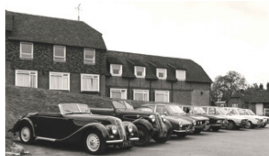
A BMW Car Club GB meeting in the 1970s showing a real mixture of BMW models, from a 1937 BMW 327 to a then new E12 520i.