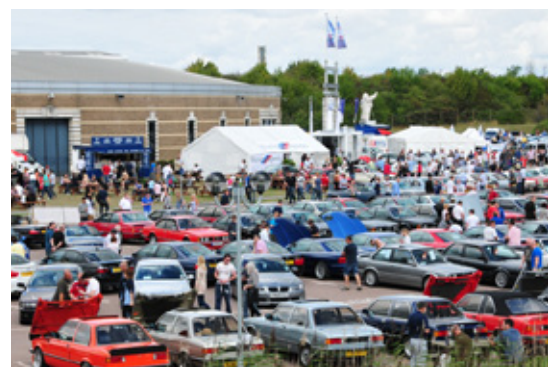
The largest gathering of BMWs in the world at our National Festival.

Many special events are being organised this year to help mark our 60 years, including the first UK Z-Fest to be held at Silverstone Classic in July and in August at our National Festival, now the biggest gathering of BMWs in the world, in August.