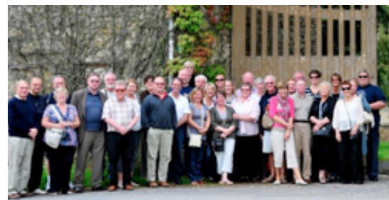
Our group stops for a photo outside a Champagne producer in the French village of La Neuville aux Larris.