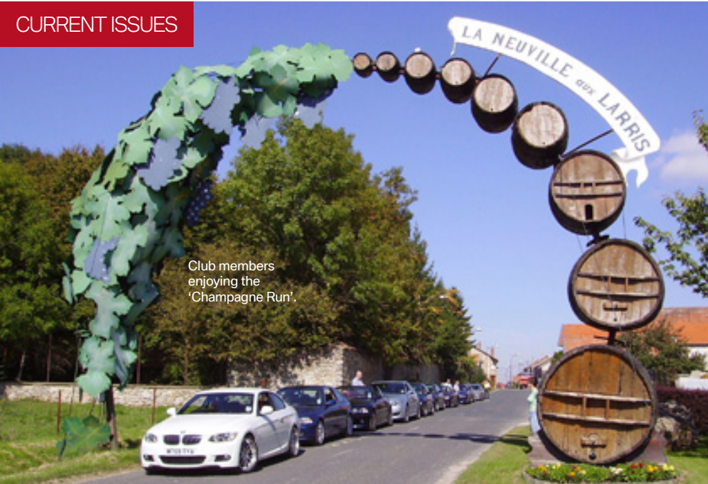
Club members enjoying the 'Champagne Run'.