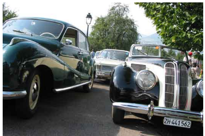
Always on show: the BMW veterans

We have new plans and ideas for the future and are currently working on a good route through the Swiss BMW Club life for our friends on two and four wheels.