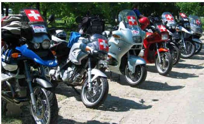
A true eye-catcher: the BMW motorcycles

The representatives of our country are the link between the autonomic Swiss BMW Clubs and the BMW Club Europa e. V. (BCE) on the one hand, and BMW (Switzerland) AG, the private BMW dealers and sponsors on the other hand. They are their contacts.