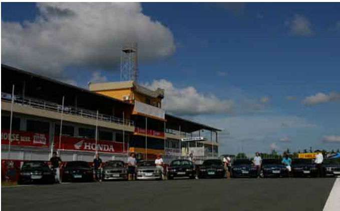
Batangas Racing Circuit (BRC) in Rosario, Batangas

Finally it was time for the full lap exercise; done with the instructor acting as passenger for each of the members' run. Some of the ultimate machines were hitting very high speeds in the straight and even on the banked turn. This certainly was the highlight of the day for every member in the group. The event saw a good variety of BMW models as well as club members – being both young and young-at-heart. The BMW 3-series was well represented, with two BMW E30s, a BMW E36 and four BMW E46s – one of which was supercharged. There was also a pair of roadsters: a BMW Z3 and a BMW Z4, both of which took to the track with their tops down. A BMW E34 was also in attendance. At the end of the day, all involved had a great time, and an even greater appreciation of their BMWs.