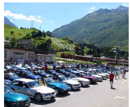
BMW Z rally to Andermatt 2004

The BMW Z3 Club Vierwaldstättersee, founded in 1999, decided in 2001 to bring the idea of staging a public BMW Z3 (roadster and coupé) meeting to life. After contacting the association and BMW (Switzerland) AG, the plans started to materialise. From the original idea emerged the Z meetings in Engelberg (2002) and in Altishofen (2003) and the Z rally in Andermatt (2004) and in Alpnach (2005). After a weekend of continuous rain, probably the worst weekend in 2005, the club decided to take a break. But it wasn't long before people were missing the rally weekend in the annual programme. So, the Z rally is back. This year it will take place in Andermatt and next year 2008 in Engelberg.