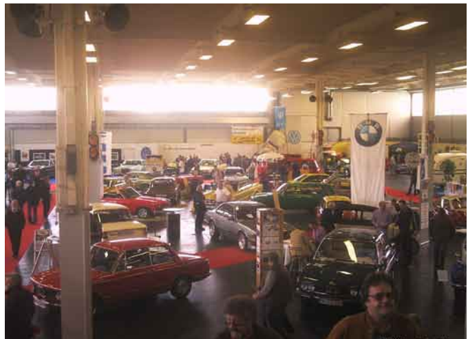
Our exhibition hall at the RETRO CLASSICS

able to be seen from a greater distance. A cross-section of 6 decades of BMW car production and a BMW motorcycle were exhibited as always. A clearly increasing interest in young classic cars is perceivable, which now includes our BMW vehicles from the Bracq era. The BMW Club stand was enhanced by the BMW Mobile Tradition (parts) counter, where a multitude of information regarding parts was available to all those interested.