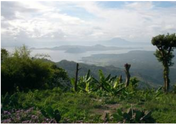
Breathtaking landscape: the trip passed the Taal Volcano

Every third Sunday of the month is a much anticipated one as it is the time when club members meet up and get to exercise their BMWs. The event calls for an early morning leisurely drive to a scenic location where group members get to have a late breakfast or early lunch; swapping stories at the same time.