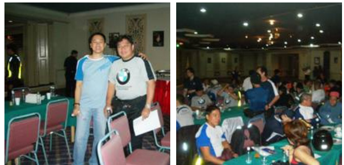
Unexpected reunion of two friends: at the casino breakfast buffet

The host sponsor met the group at the casino entrance and led the visitors into the meeting hall. It was here where a sumptuous breakfast buffet was set-up. The two groups unwound and rested before starting to partake of the excellently prepared food. As the members of the two clubs ate, they were able to swap stories. In fact there was even a moment where two old time friends learned about their memberships in pursuit of their passion – the BMW motorcycle and the BMW automobile.