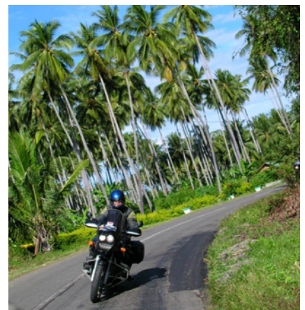
Past palm trees: a popular biker route