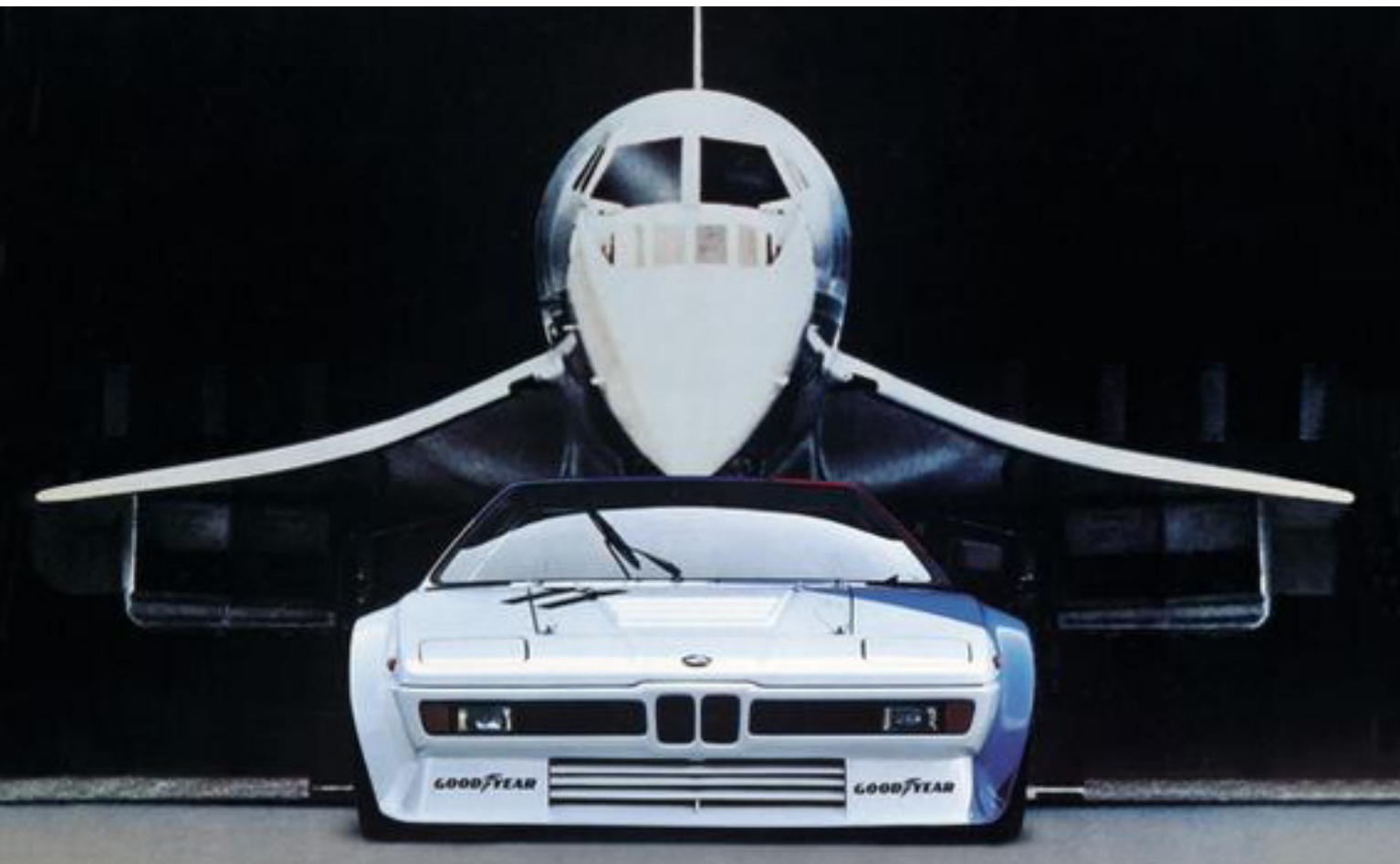
BMW M1, 1981 – year of birth of the International Council of BMW Clubs

Newsletter of the International Council of BMW Clubs