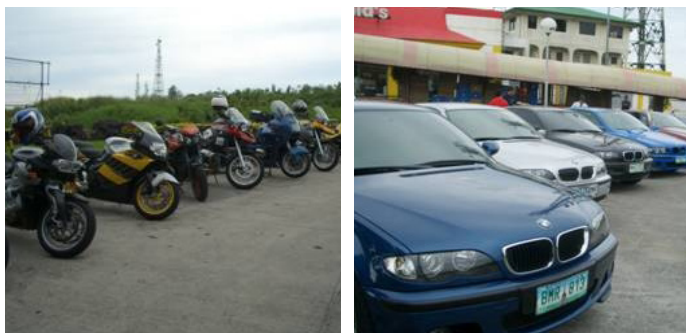
First common event of the two Philippine BMW Clubs

After breakfast and the story telling, the group then started to utilize the free tokens provided at the casino floor. The event ended with each going their separate ways. It was truly a momentous occasion as the combined run was indeed a successful and fun one. With the sun coming out to support the activity, it will definitely come out again in support of future combined activities between the two clubs.