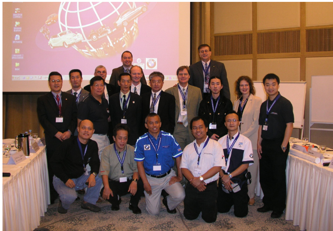
Planning annual meetings: the founders of the umbrella organisation of Asian BMW Clubs

We also spend time getting to know one another and enjoyed some wonderful social opportunities. One of these was learning about durian, the “king of all fruit”. It has a custard-like, creamy, almost velvety taste. D24 is one of the best types of durian. But why is it banned? In a word, it stinks, and not everyone loves the taste. Personally, I enjoyed it immensely. But no, I did not take any home.