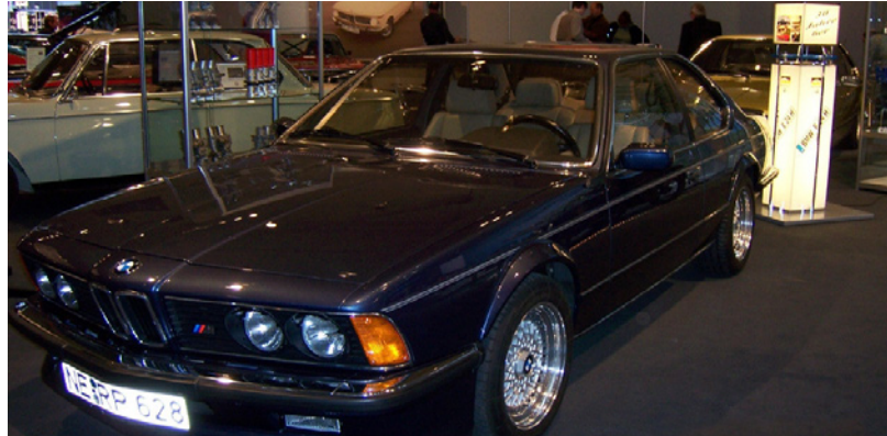
BMW 6er Club e. V. excellently presented at the 18th TECHNO CLASSICA

A 1980 BMW 635 CSi was provided from the BMW Mobile Tradition stocks. This year the stand attracted many visitors – probably not only because of the anniversary but also due to