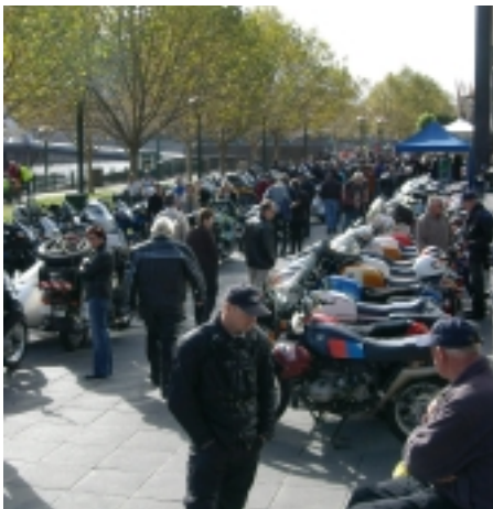
Parade along the Promenade.

The members decided which owners would take home the trophies. As