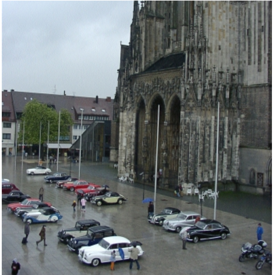
The worthy backdrop of Ulm's world-famous Minster.

Proud town houses and patrician homes next to modest craftsmen's cottages and an elaborately decorated maypole bear witness to Blaubeuren's deep sense of tradition. Waving, drumming children cheerfully greet the BMW Museum that rolls past. It's an inspiring experience that will be repeated as we pass through many more towns and villages.