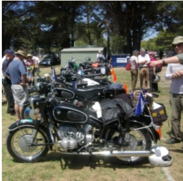
Enthusiasts discussing the merits of the exhibits.

bled eight of these classic BMWs along with many other older and current models. The Earles fork machines being the feature of the club display. There was a constant flow of interested onlookers throughout the day.