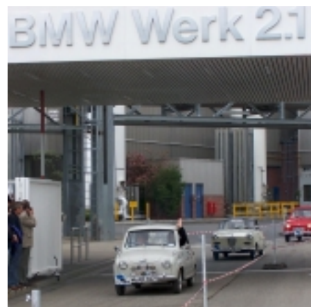
Souvenir photos at BMW Plant 2.1.