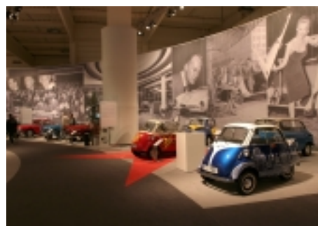
The BMW Isetta celebrates its 50th Anniversary this year!

http://www.bmw-m1-club.de http://www.isetta-club.de http://www.goodwood.co.uk http://www.3er-club.de http://www.bmw-motorrad.com http://www.bmwvcca.com http://www.messe-duesseldorf.de http://www.bmw-v8-club.de http://www.2000kmdurchdeutschland.de http://www.bmwmoa.org http://www.bmwz3club.ch http://www.bmw-club-europa.org http://www.bmw-veteranenclub.de http://www.iaa.de http://www.tarheelbmwcca.org/oktoberfest.htm