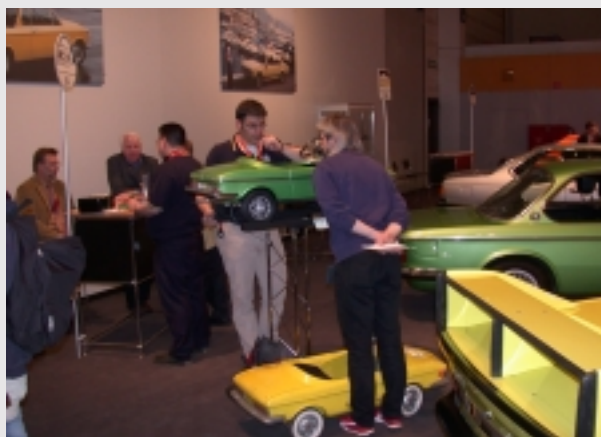
Crowd pullers: exhibits large and small.

New contacts were forged, existing friendships consolidated, and technical problems explained