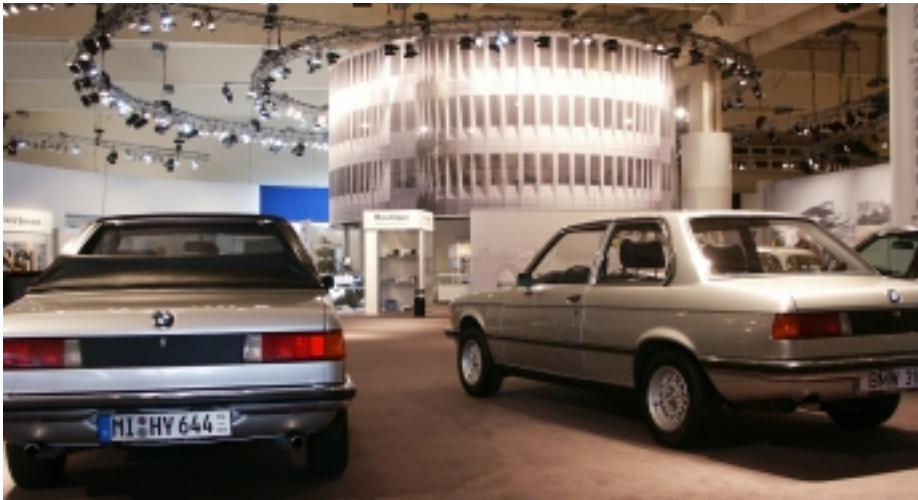
The BMW 3er Club (E21/E30) was one of the participants in the Techno Classica 2005.

From 7th to 10th April, the world's greatest classic show – the Techno Classica – was held in Essen for the 17th time.