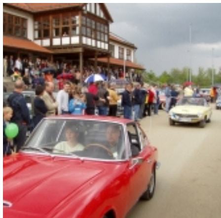
Convoy through the town.

The drivers' association Goggomobil- und Glasfahrergemeinschaft Dingolfing (GfG) organised the 32nd International Glas Club Meeting. Some 800 people with around 400 vehicles took part in the event, which was extremely well organised. The meeting was held at Dingolfing's ice stadium, where the