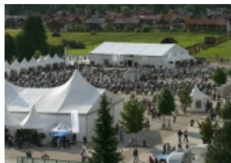
The BMW Motorrad Biker Meeting 2005 celebrates "25 Years GS".