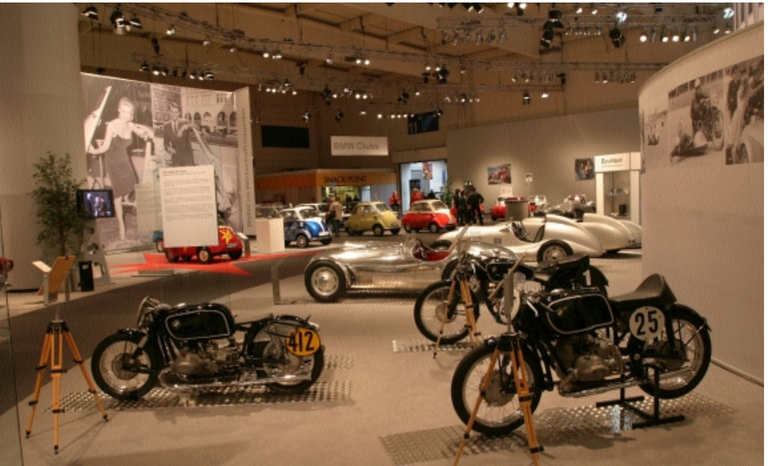
The Techno Classica in Essen – the biggest classic exhibition in the world.

Newsletter of the International Council of BMW Clubs